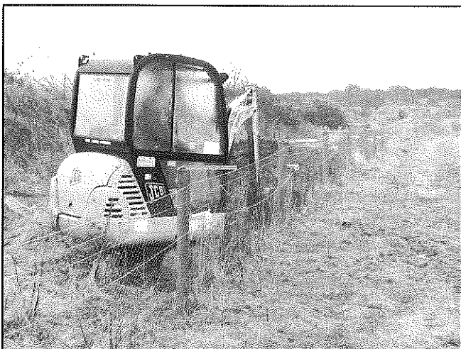
Derek at work in the digger on Pit 4

Pit 2—Contractors clearing footpath section on Pit 2 side. Contractors starting to install new otter-proof fence along 250m of the footpath section. Clearing undergrowth behind swims and removing unwanted snags. Planning route of fencing to be installed. Clearing route for paths.