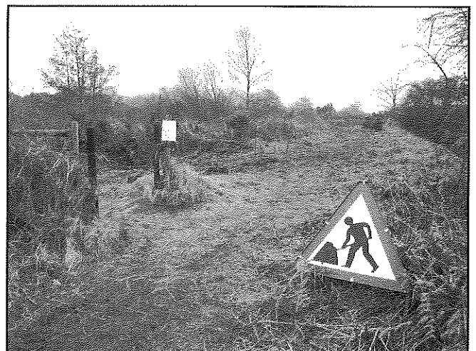
Contractors notices on Pit 2