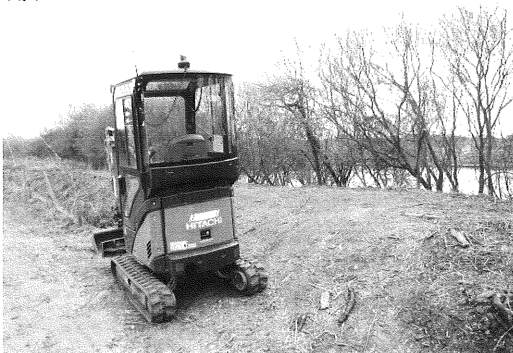
Below: Digger helping to clear the bank along the footpath section of Pit 4